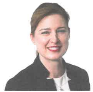
Julie Collins MP Federal Member for Franklin